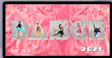
DANCE Poster (12x24) Framed