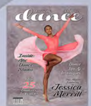
Magazine Cover (8x10)