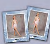
4x5 Magnets (Set of 2)