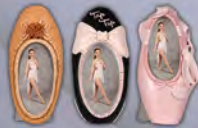
Dance Shoe Frames