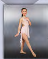
Metallic Print (8x10 & 11x14)