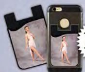
Card Caddy Phone Wallet