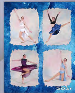
Composite 16x20 4 Images