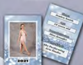
Trader Cards (Set of 8)