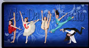
Dance Panoramic Composite (12x24) Framed