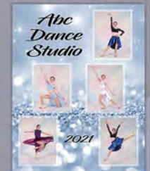
Composite 11x14 5 Images