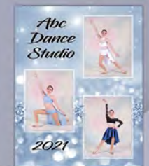
Composite 11x14 3 Images