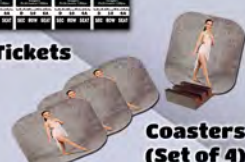
Coasters (Set of 4)