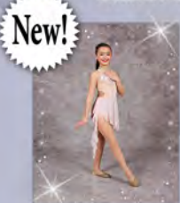
Sparkle Prints (8x10 & 11x14)