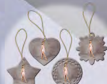
Holiday Ornaments Porcelain