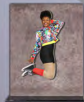
Statuette Pop-Out (8X10)