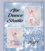
Composite 8x10 2 Images